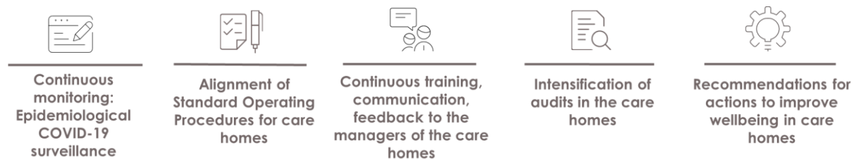
Figure 3 Activities implemented through the policy

The following activities relied on strong and close collaboration between the DMSV, MoH and LTC providers, marking a new cooperation that had not previously been established, due to the traditionally separate strands of work carried out in relation to LTC sector work as a whole (including community care, home care and residential care). As shown in the Figure below, the initiative sought to: (i) enhance epidemiological surveillance through constant monitoring, (ii) set Standard Operating Procedures to be applied across all care homes, (iii) provide capacity-building training initiatives and strengthen communication and feedback channels, (iv) increase audits in care homes to ensure upholding of SoPs and (v) develop recommendations on how to improve residents' wellbeing and the overall quality of LTC care services.